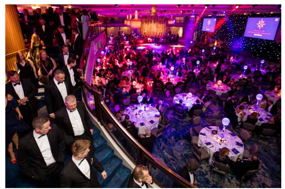
British Safety Council Annual Conference.