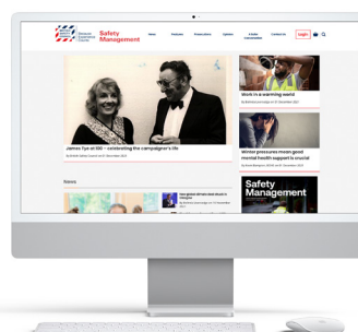
Safety Management website

The monthly guides (PDF format) provide advice on managing a variety of health, safety, wellbeing and sustainability risks at work. They are updated and re-published every two years. The guides are sent to British Safety Council members who subscribe to the Tools and Templates membership package. They feature advertising (see next page for the topics).